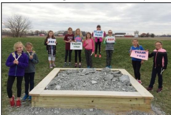
Jerusalem Fossil Park