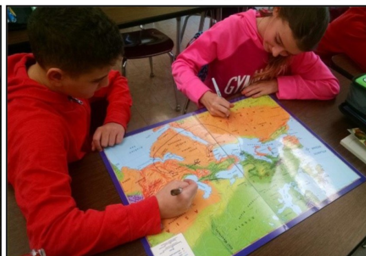
Mapping World History

Hands-on opportunity for elementary students to travel back in time 375 million years ago when Ohio was a great sea. Offers ability to learn about Devonian Era.