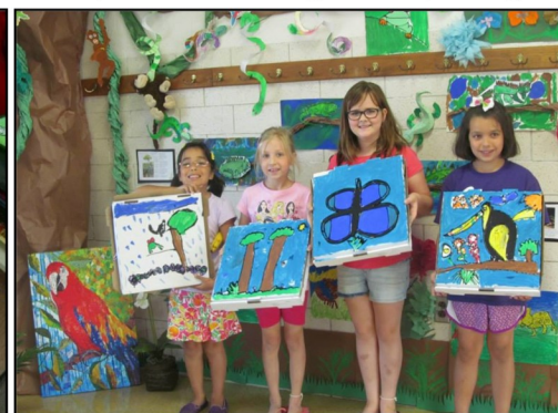
Rainforest Adventure Art Camp

Hands-on opportunity for middle school students to build a chronological foundation of themes and key events in ancient history.