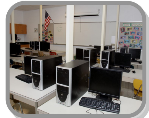
Clay High STEM– Lego Room