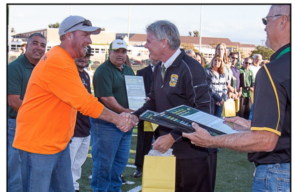
Gifts of Appreciation to Press Box donors.